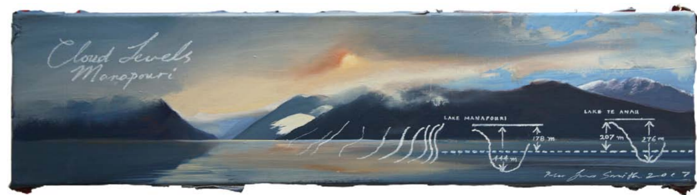
Cloud Levels at Manapouri (2017) oil on linen 210 x 820mm