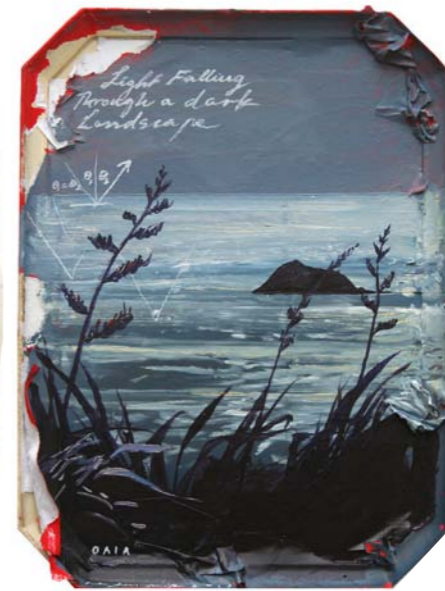
Lux Aeterna (2017) oil on linen 360 x 550mm