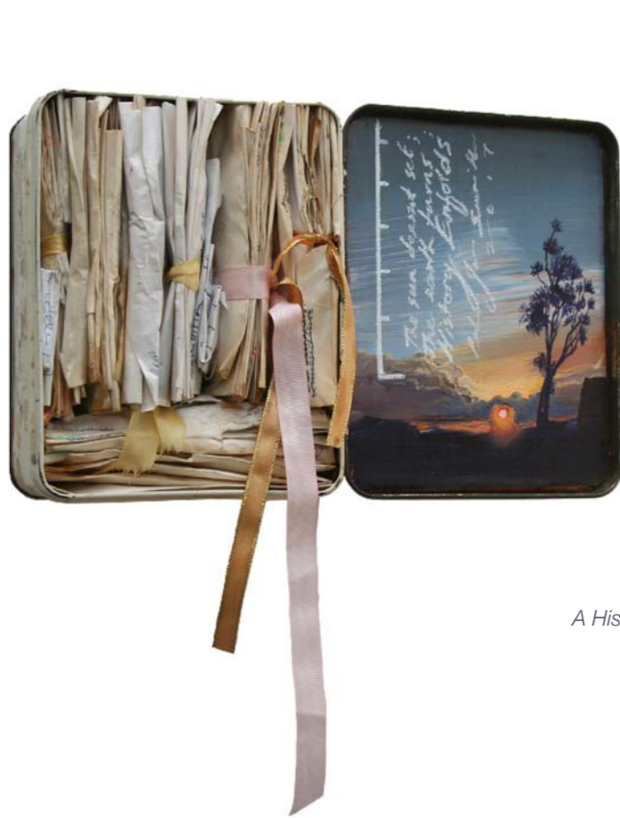
The Sun Doesn't Set; The Earth Turns; History Unfolds (2017) oil on linen in tin 200 x 320 x 100mm