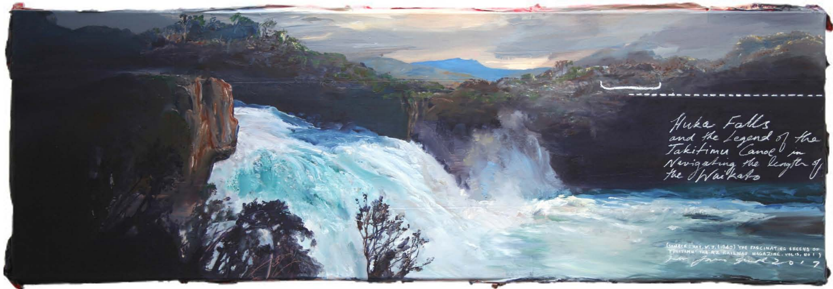
cover: Catchlight (2017) [detail] oil and mixed media on linen 910 x 1100mm