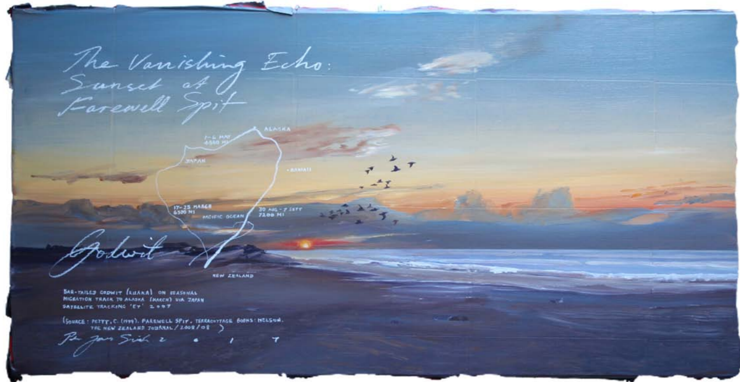
The Vanishing Echo (2017) oil on linen 610 x 1220mm