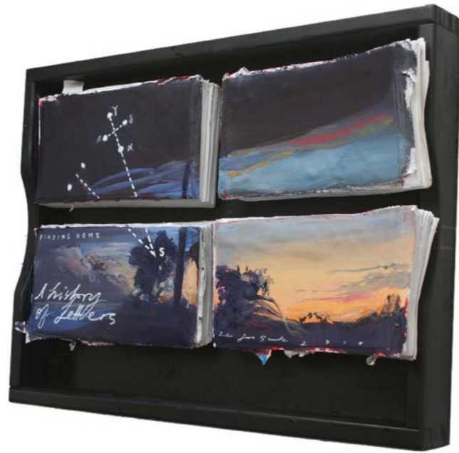
A History of Letters (2017) oil on linen and envelopes 380 x 520 x 90mm