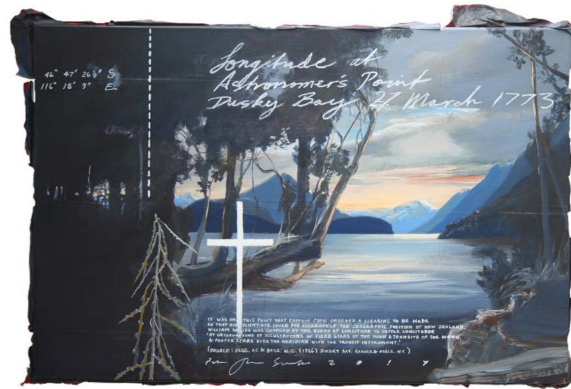
Longitude At Astronomer's Point (2017) oil on linen 620 x 920mm