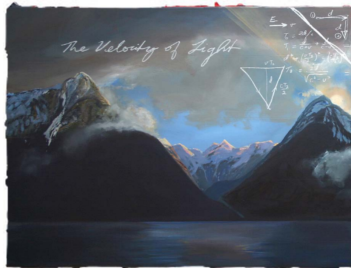
The Velocity of Light (2017) oil on linen 2 panels: 920 x 2440mm