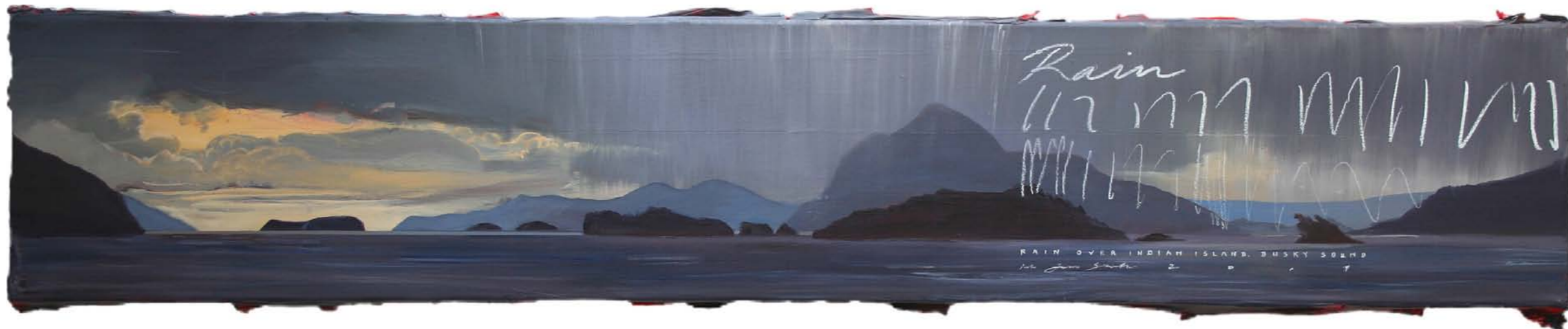
Rain (2017) oil on linen 320 x 1700mm