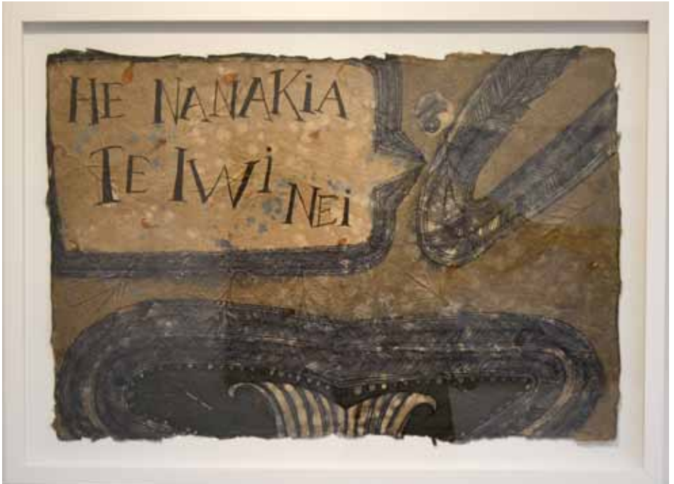
Charlotte Graham | He Nanakia Te Iwi Nei (2003) ink, bitumen, shellac, paper 500 x 800mm $1,600