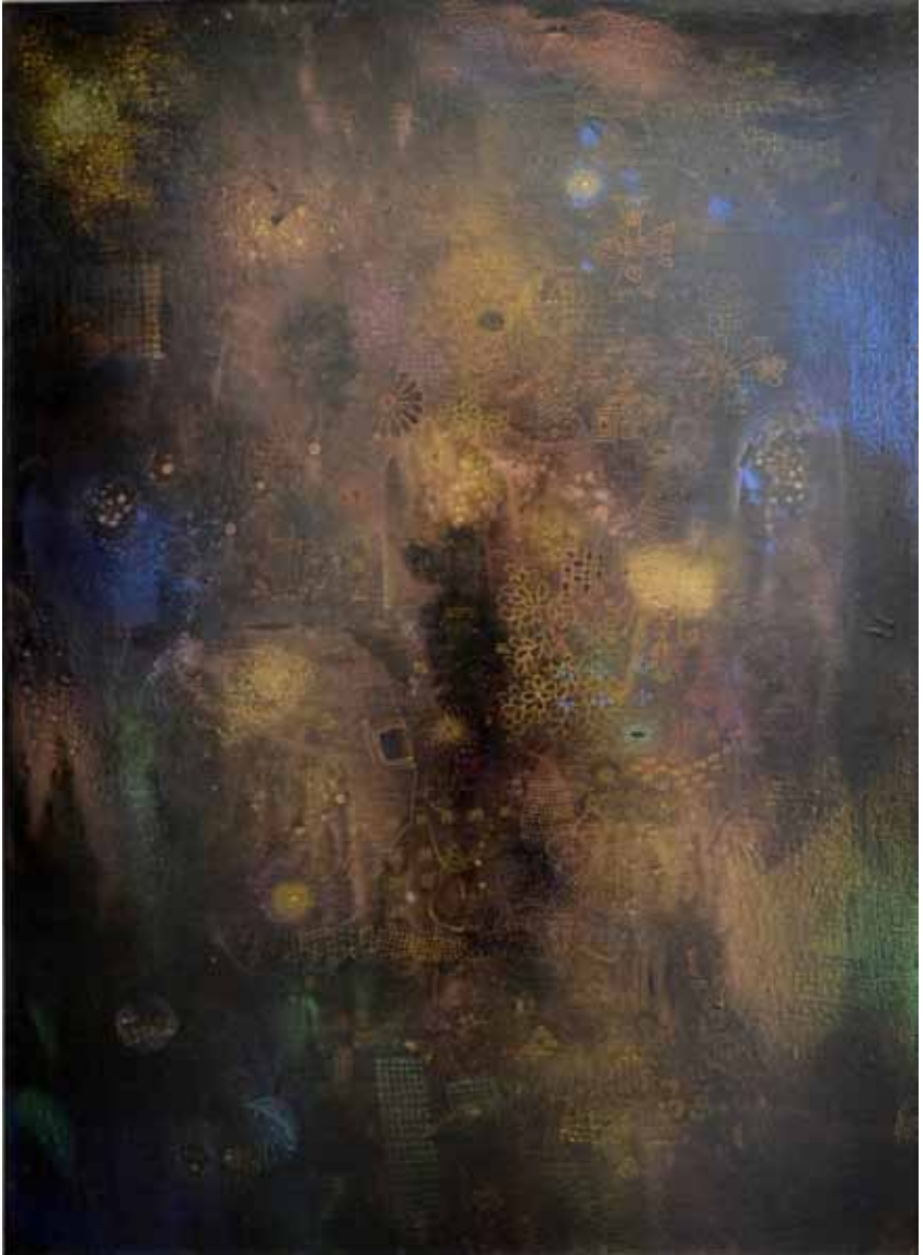
Prakash Patel | Black Forest (2013) acrylic on canvas 1270 x 900mm $5,500