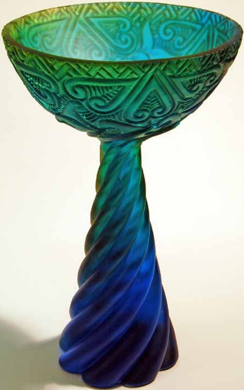
Evelyn Dunstan | Humarie Wai (2013) cold worked, sandblasted, acid etched & hand polished 335 h x 200 w/d mm $5,200