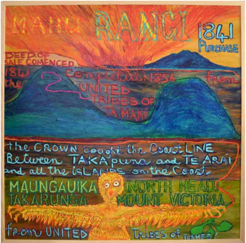
Emily Karaka | Mahurangi: Maungaika and Takarunga purchases (2015) oil on kauri board 1000 x 1000mm $7,500