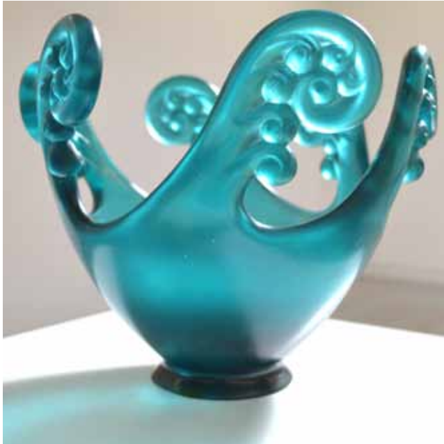
Evelyn Dunstan | Puni (2017) cold worked, sandblasted, acid etched & hand polished green: 230h mm, blue: 210h mm $4,600ea

(next pg.) Vaka'uta Lingikoni | Sky Travel (2004) acrylic & ink on paper 720 x 560mm $2,500