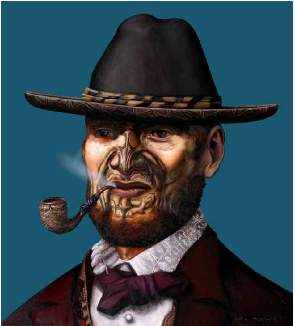
Paul Jackson | Man With Pipe (2016) oil on linen 820 x 735mm $10,500