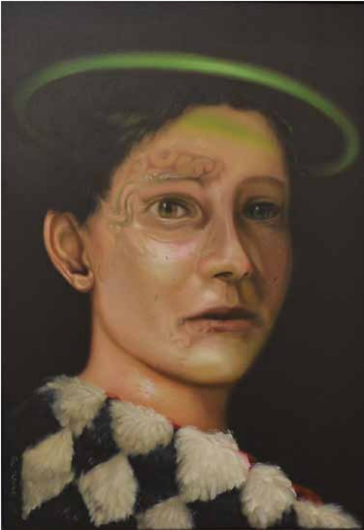
Paul Jackson | Pounamu Angel (2010) oil on panel 485 x 330mm $8,200 (back cover) Paul Jackson | Lazarus (2010) oil on panel 900 x 2500mm $24,000