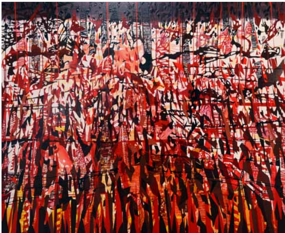
Glen Wolfgramm | Know Show (2014) acrylic on canvas 1300 x 1600mm $8,500