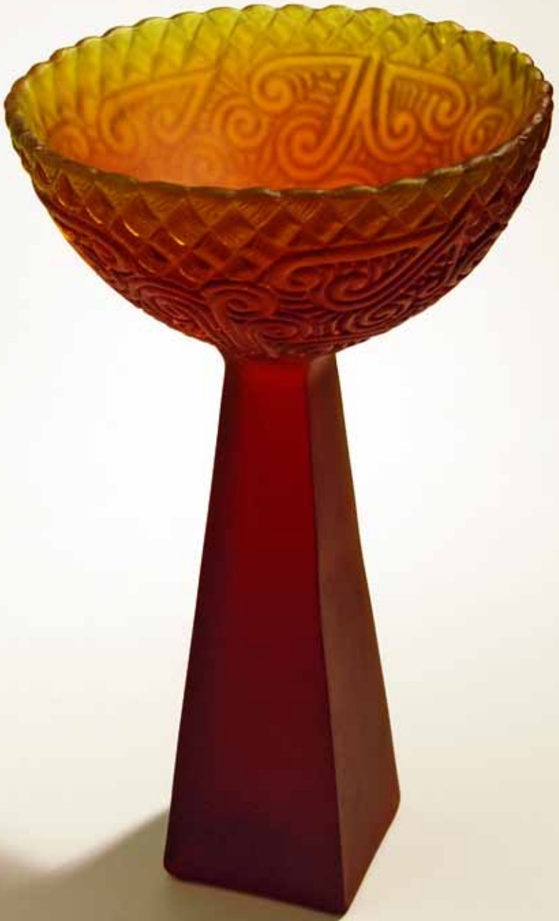
Evelyn Dunstan | Humarie Whenua (2013) cold worked, sandblasted, acid etched & hand polished 335 h x 200 w/d mm $5,200