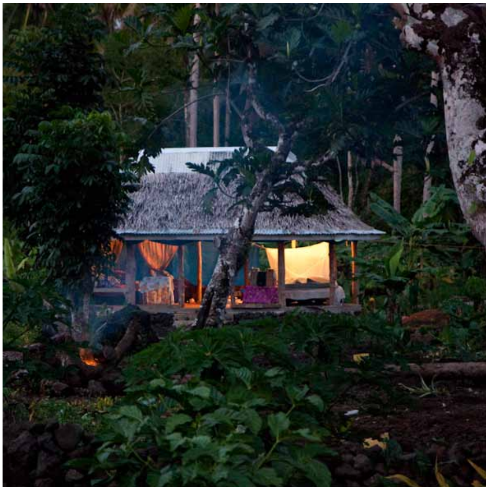
Stacey Simpkin | There Is A Light (2015) framed ed.1/3 pigment ink printed on archival paper with conservation glass $1,200